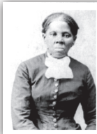
Harriet Tubman (c.1820–1913)

Anthony is one of the most noted women's rights activists in U.S. history, advocating for human rights and helping win the right to vote.