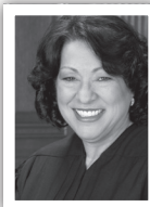
Sonia Sotomayor (1954– )

Heumann is a renowned disability rights advocate. She was confined to a wheelchair after suffering from polio as a child. She fought back against discrimination, becoming the first person in a wheelchair to teach in a New York City public school and helped develop the Individuals with Disabilities Education Act so that all kids with disabilities get the education they deserve.