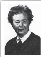
Gertrude B. Elion (1918–1999)

A lifelong New Yorker and first lady of the U.S. from 1933 to 1945, Roosevelt was a speaker and human rights advocate. She fought for disadvantaged Americans and drafted the UN Universal Declaration of Human Rights.