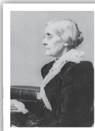
Susan B. Anthony (1820–1906)

A native of Johnstown, NY, she helped organize the first women's rights convention in Seneca Falls and traveled around the world fighting for equality.