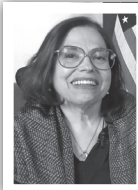
Judith Heumann (1947– )

Born in Brooklyn to immigrant parents, Chisholm was a member of the state Assembly and became the first African-American woman elected to Congress. In 1972, she was the first African-American and first female major-party candidate for the presidency.