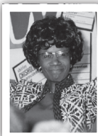
Shirley Chisholm (1924–2005)

Elion, of Manhattan, developed treatments for malaria, meningitis and leukemia. She earned a Nobel Prize in Medicine in 1988, one of only 10 women at the time who had earned a Nobel Prize in the sciences.