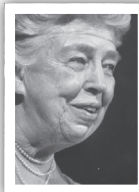
Eleanor Roosevelt (1884–1962)

Tubman escaped slavery in 1849 and became a conductor of the Underground Railroad. She risked her life to rescue slaves to freedom. She purchased land in Auburn in 1859 where she lived the rest of her life.