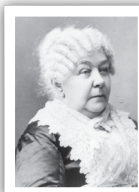
Elizabeth Cady Stanton (1815–1902)

It's important to study women's history because of their contributions to every field, including medicine, law and government. But it's also important to know it took a long time and a lot of hard work for women to enact change and progress. Women had to fight just to own property, earn (and keep) their wages, vote and even go to school.